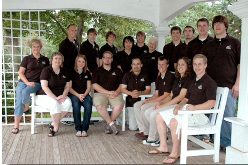
Summer 2009 P3 Students and Faculty / Staff

Student interns provide pollution prevention assistance to Nebraska businesses by performing waste assessments and waste reduction projects, and providing each client with a written report detailing waste minimization suggestions. Over 500 business clients based in 70 different Nebraska communities have been assisted between 1997 and summer 2009. During this period, the P3 program helped Nebraska businesses save a