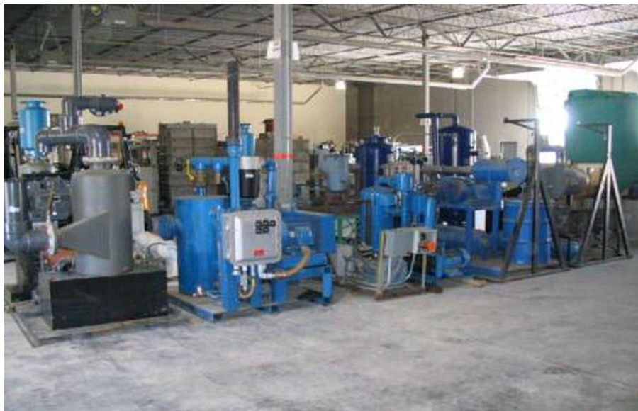
SVE/AS (Soil Vapor Extraction/Air Sparging) systems lined up in the NDEQ Lincoln warehouse facility. The cost of the units runs from $20-40,000 each.

By 2004, the Petroleum Remediation Section had proven that equipment reuse would work, and expressed the need for a larger, more accessible storage building. In June 2005 equipment was moved to a warehouse in Lincoln, the same city as NDEQ agency offices. The new warehouse has a forklift rated to lift 5,000 pounds and a semi-truck loading dock, as well as water, heat, electricity and bathrooms. Low profile vehicles with trailers can drive into the warehouse for loading and unloading and drive through to