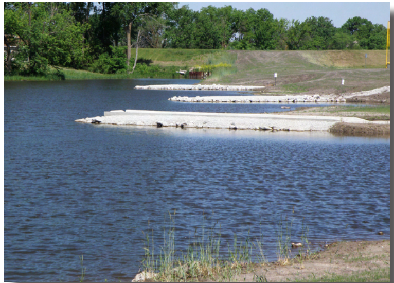
The new Old Lake in Hooper's Memorial Park.

The excavation of 14,400 cubic yards of sediment increased maximum lake depths from two feet to over 12 feet. The shoreline of the lake was re-shaped to include fishing jetties, and part of the stormwater drainage was routed around the lake to help maintain good water quality. The lake was stocked with largemouth bass, bluegill, and catfish in 2009.