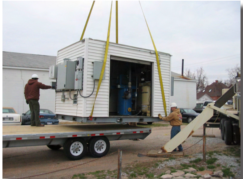
Remediation systems are containerized and can be moved from site to site as needed.

There was no electricity, heat or water at this location, but the space was adequate for the purpose. At this time, prior to 9/11, the facility was acceptable, despite its remote