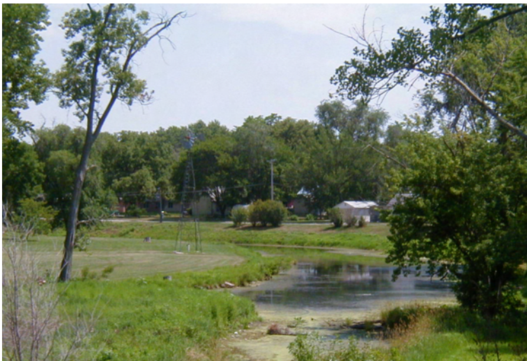
Old Lake before.

Significant improvements in water quality followed the project. Total phosphorus and total nitrogen in the lake were reduced by 82 percent and 87 percent respectively, and water clarity increased from a few inches to 28 inches.