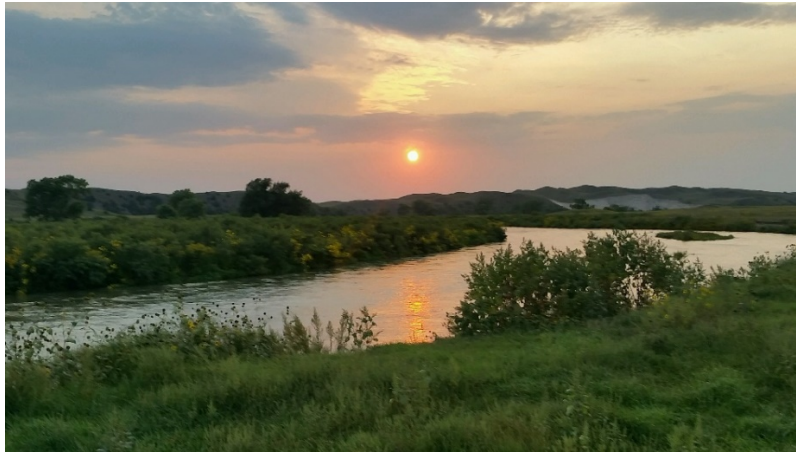
Middle Loup near Thedford