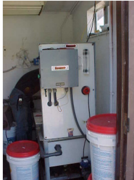
A Chlorination System

Remember that the typical useful life of disinfection systems is 10 years. In this example, adjusted useful life for the chlorinator is 5 years lower than the typical useful life because the system has not properly maintained it.