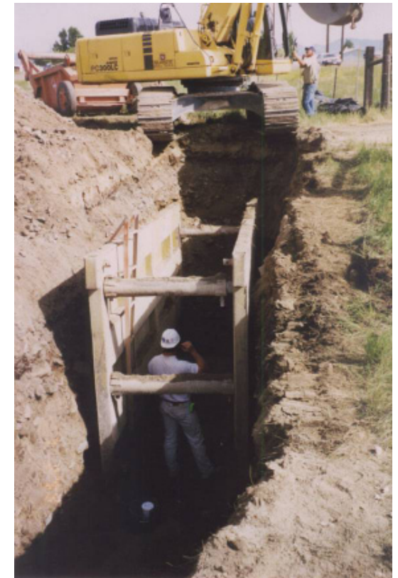
Preparations for Pipe Installation in a Distribution System