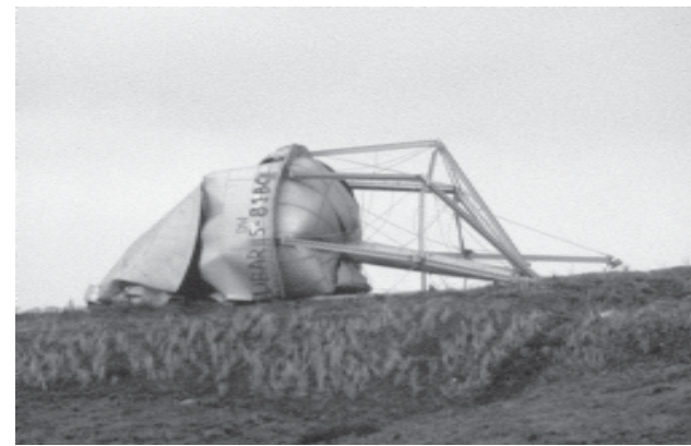
A Storage Tank that Has Outlived Its Useful Life!

For more information on strategic planning, see EPA's Strategic Planning Workbook (EPA 816-R-03-015), which you can obtain by calling the Safe Drinking Water Hotline at (800) 426-4791.