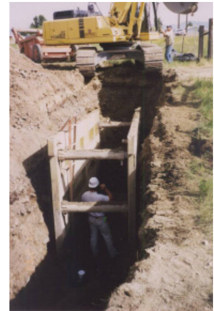
Preparations for Pipe Installation in a Distribution System