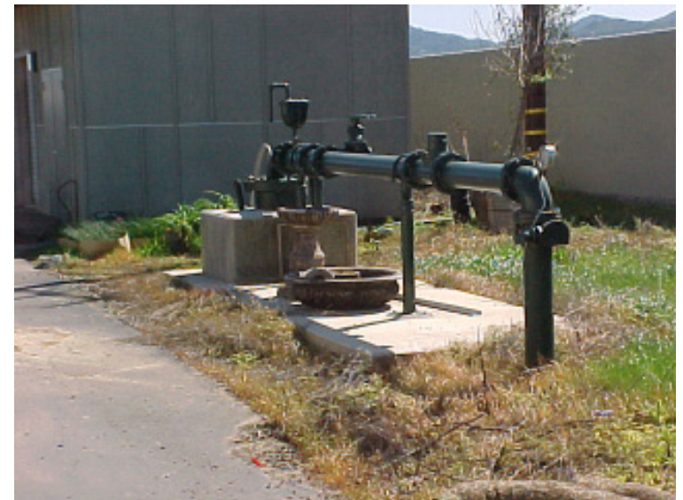
A Ground Water System Well