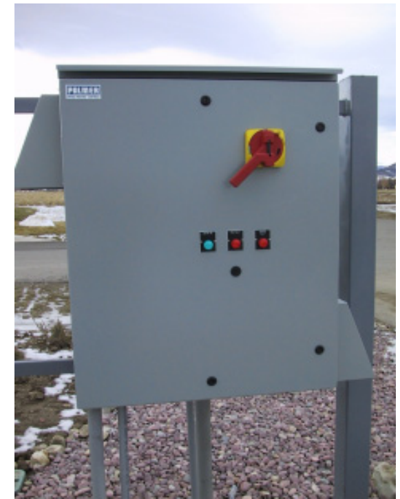
A Variable Frequency Drive

Remember that the typical useful life varies by type of electrical equipment. The typical useful life for computers is 5 years, sensors typically last 7 years, MCCs, and VFDs typically last 10 years, and transformers, switchgears, and wiring typically last 20 years.