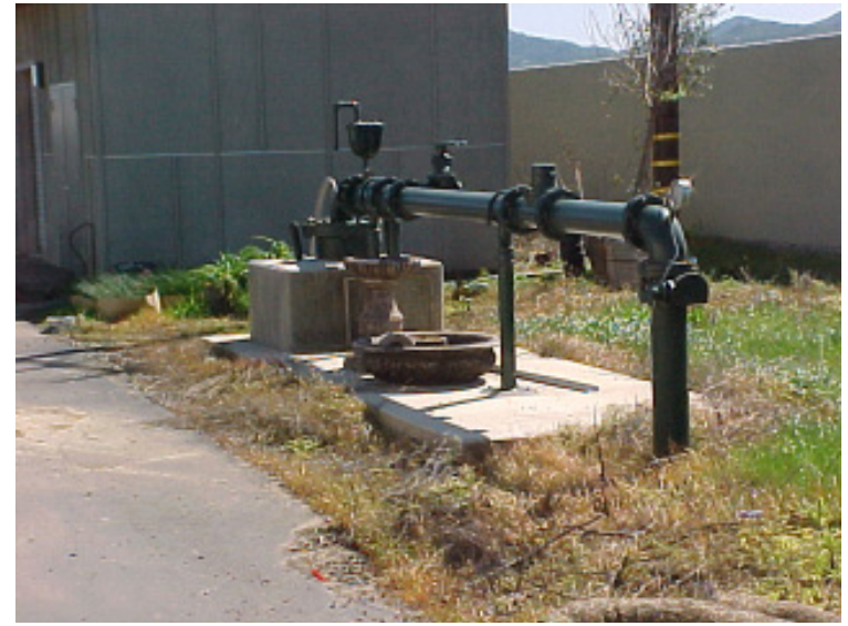
A Ground Water System Well