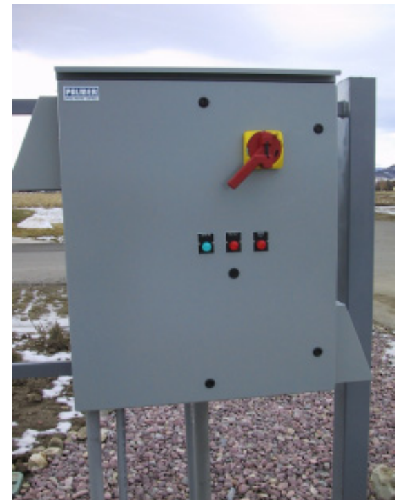
A Variable Frequency Drive

Remember that the typical useful life varies by type of electrical equipment. The typical useful life for computers is 5 years, sensors typically last 7 years, MCCs, and VFDs typically last 10 years, and transformers, switchgears, and wiring typically last 20 years. In this example, the adjusted useful life is the same as the typical useful life because the computer has been properly maintained.