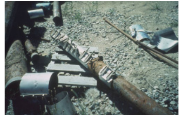
Service Lines Deliver Water to the Customer's Plumbing Connection

Remember that the typical useful life for service lines is 30 years. In this example, the system has estimated that the adjusted useful life will be the same as the typical useful life because in the past its distribution system assets have lasted the typical number of years.