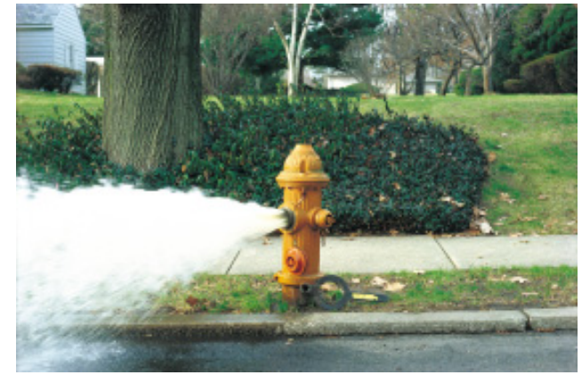
Hydrants Provide Water for Fire Suppression, Line Flushing, and Irrigation.