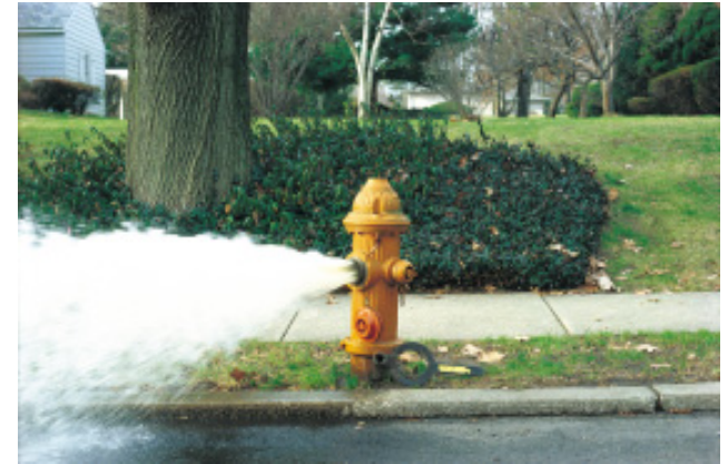
Hydrants Provide Water for Fire Suppression, Line Flushing, and Irrigation

Remember that the typical useful life for hydrants is 40 years. In this example, the adjusted useful life is the same as the typical useful life because both hydrants have been properly maintained.