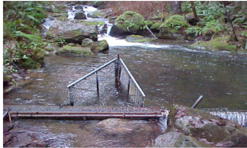
A Drinking Water Intake for a Surface Water System