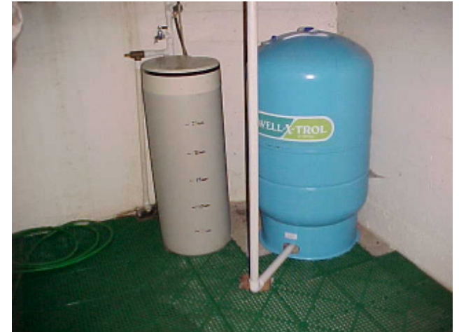
A Hydropneumatic Storage Tank