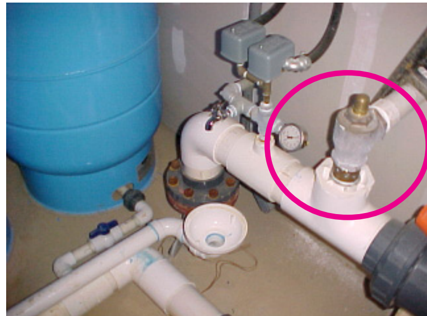
An Air-Pressure Relief Valve