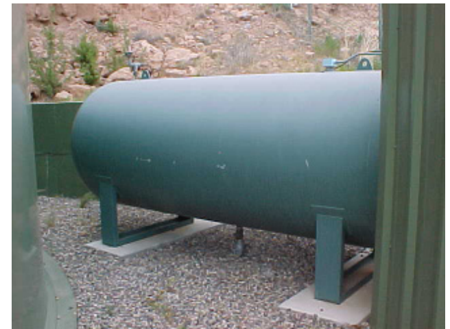
A Metal Storage Tank