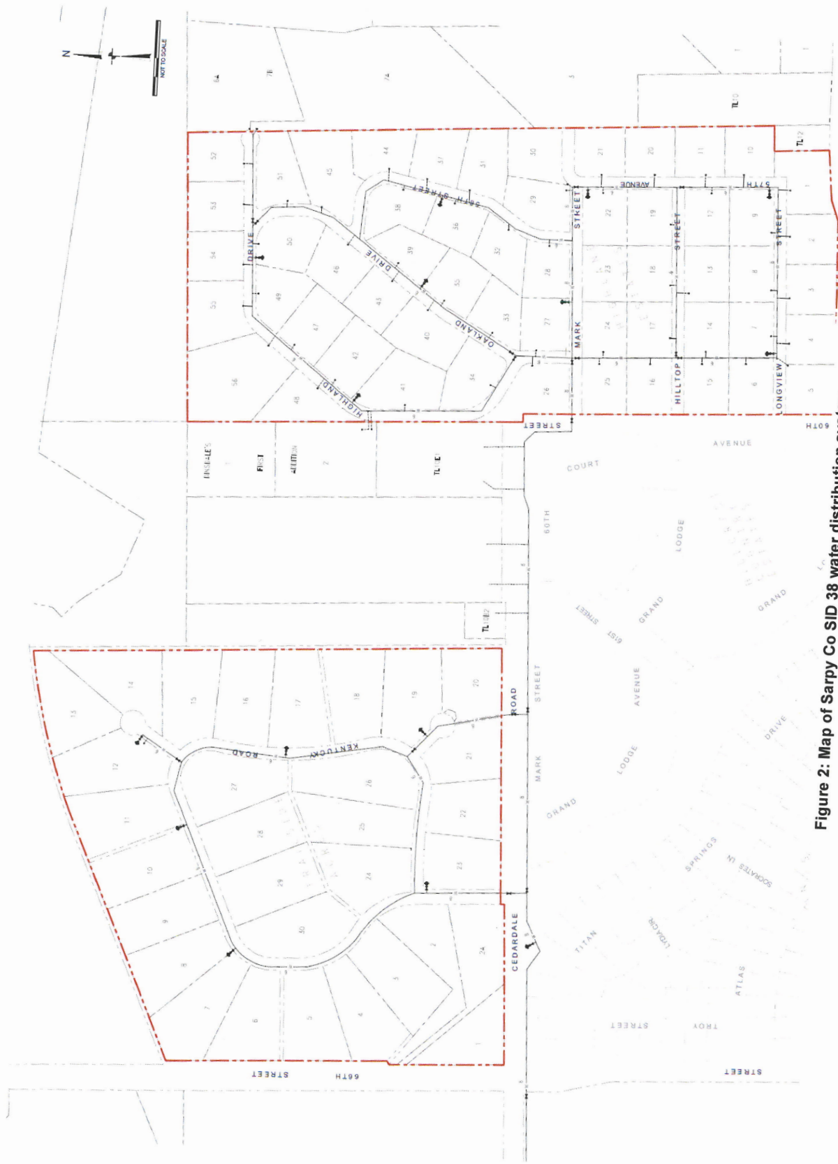
Figure 2: Map of Sarpy Co SID 38 water distribution system