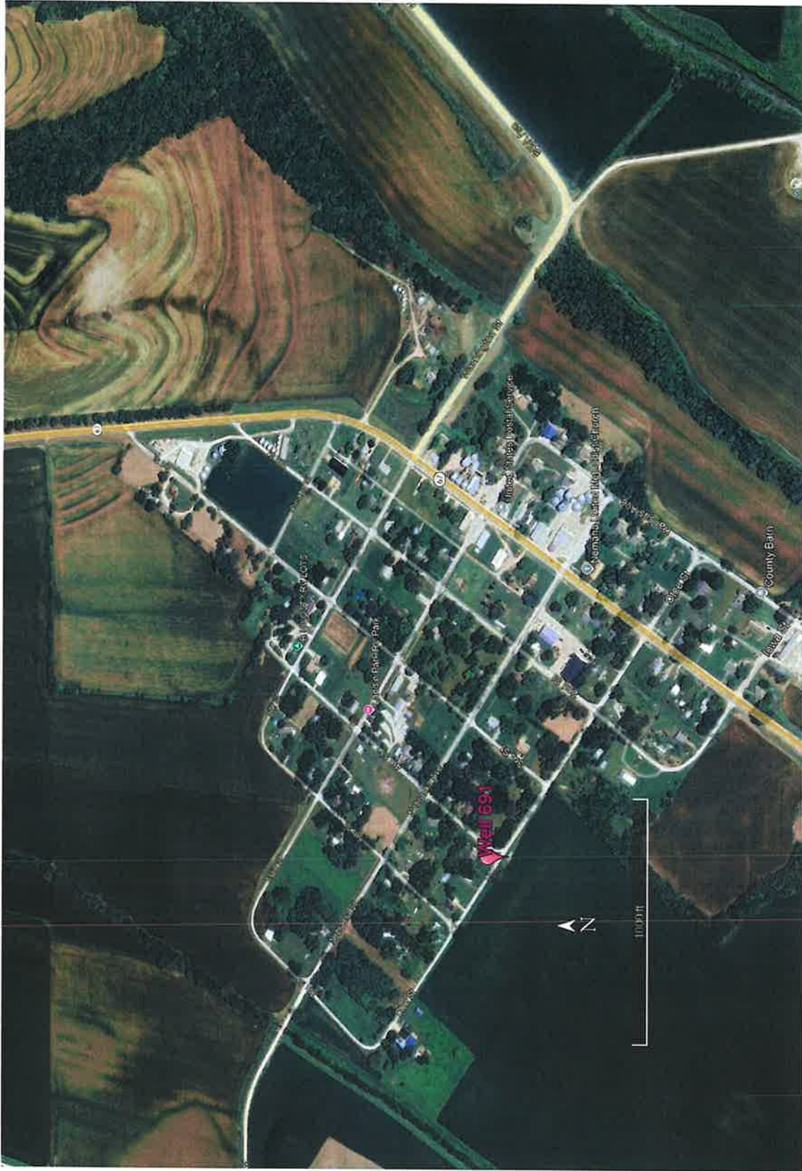
Figure 1: Map of the Village of Nemaha, showing Well 691 where the well reline will take place