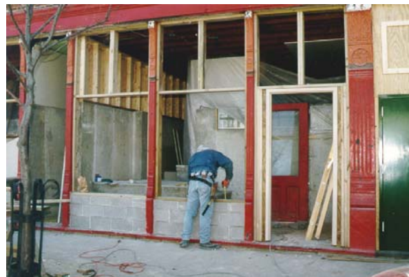
Floodproofing the vestibule of a storefront

The town took advantage of the very high ceilings common to many of the older buildings in Darlington; their height allowed first floors to be elevated out of flood danger with minimal impact to other historic features. Basements were filled with sand and gravel, floodproofing that portion of the