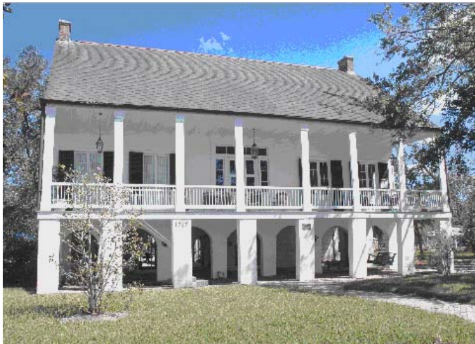
Elevation of a historic residence in Mandeville, Louisiana

While elevating a structure above the BFE will provide the structure the most protection, a less intrusive elevation may be desired or more feasible for a historic structure. Other protection measures, such as elevating utilities and equipment above the BFE, should be considered if elevating a historic structure to the BFE is not practicable.