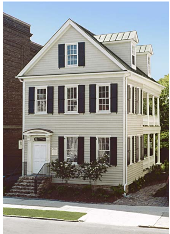
113 Calhoun today