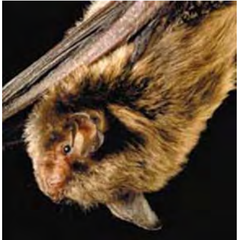
Indiana bat.

The Endangered Species Act (16 U.S.C. 1531–1544; ESA) was enacted by Congress in 1973 in recognition that many of our Nation’s native plants and animals were in danger of becoming extinct. The ESA directs the Service to identify and protect these endangered and threatened species and their critical habitat, and to provide a means to conserve their ecosystems. To this end, federal agencies are directed to utilize their authorities to conserve listed species, and ensure that their actions