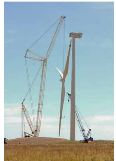
Towers are being lifted as work continues on the 2 MW Gamesa wind turbine that is being installed at the NWTCC.