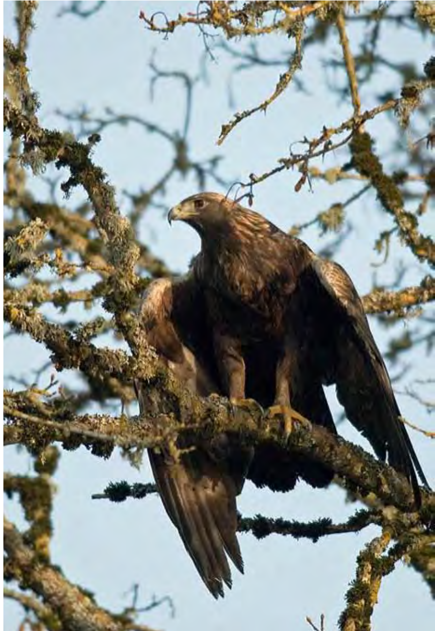
Golden eagle.

by the project, or lost due to various types of mortality including collisions with turbine blades.