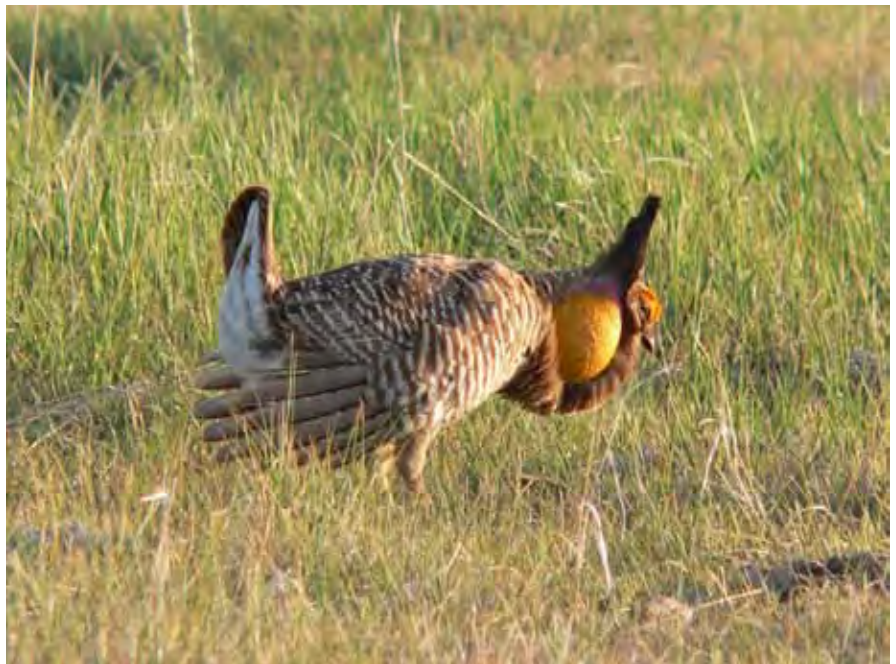
Greater prairie chicken.

To the extent that a federal nexus with a wind project exists, for example, developing a project on federal lands or obtaining a federal permit, the lead federal action agency should make its decision based in part on a developer's commitment to mitigate adverse environmental impacts. The federal action agency should ensure that the developer adheres to those commitments, monitors how they are implemented, and monitors the effectiveness of the mitigation. Additionally, the lead federal action agency should make information on mitigation monitoring available to the public through its web site;