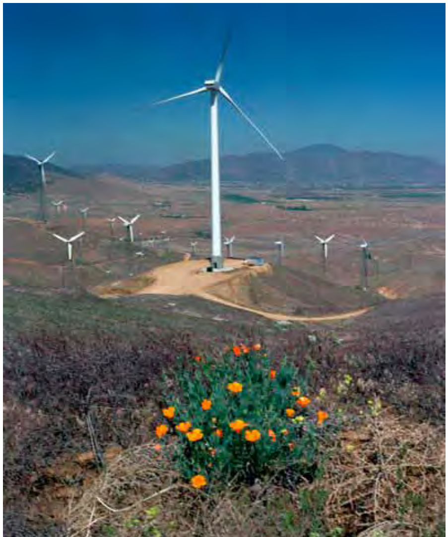
Wind turbines and habitat.

Impacts of a project will have population level effects if the project causes a population decline in the species of concern. For non-listed species, this assessment will apply only to the local population.