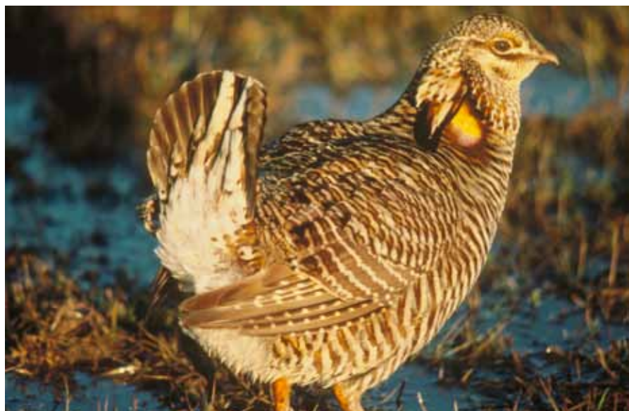
Attwater's prairie chicken.

Some areas may be inappropriate for large scale development because they have been recognized according to scientifically credible information as having high wildlife value, based solely on their ecological rarity and intactness (e.g., Audubon Important Bird Areas, The Nature Conservancy portfolio sites, state wildlife action plan priority habitats). It is important to identify such areas through the tiered approach, as reflected in Tier 1, Question 2 below. Many of North America's native landscapes are greatly diminished, with some existing at less than 10 percent of their pre-settlement occurrence.