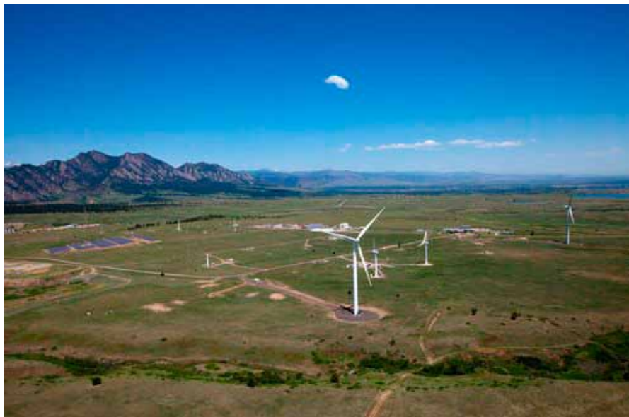
Open landscape with wind turbines.