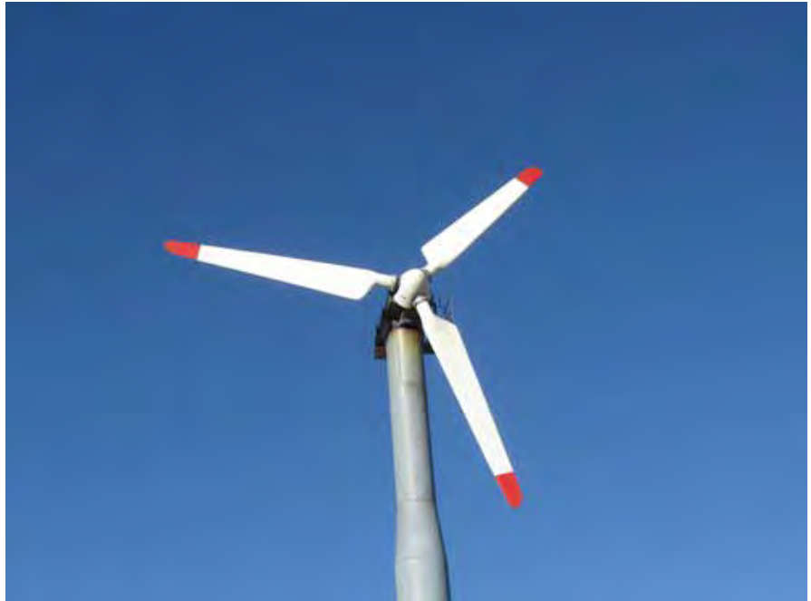
Wind turbine in California..

The Service will explore opportunities to: